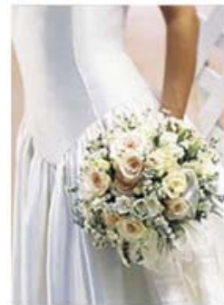
Bouquet for the bride and boutonniere for him.