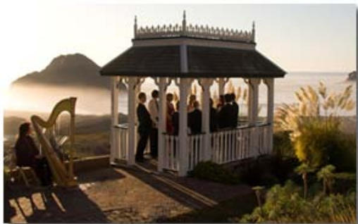
Wedding Ceremony in the Gazebo

Perfect for small weddings, vow renewals or an elopement for just the two of you!!!